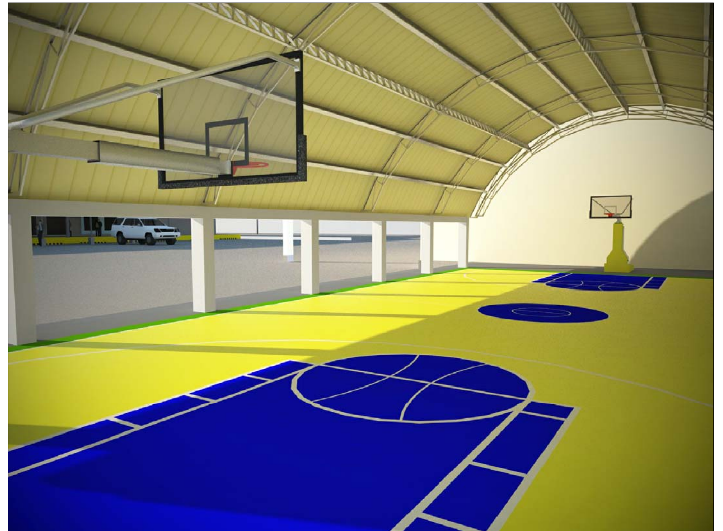
PERSPECTIVE SCALE NTS